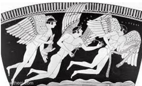
The Greek's Trinity of Erotes, an example of male trinities common in ancient cultures

the Roman occupation. They grew increasingly fearful that the Way could turn into a revolt so they plotted to have Jesus executed. Not long after his execution, some of his followers began making claims that he was still alive. At that point a process began that transformed this social activist into the Christ figure. Layers and layers of theological doctrines and mythologies from all four corners of the earth were piled upon Jesus to the point that the real person disappeared up the ladder into complete godhood. When we peeled away these layers we discovered a great teacher who bequeathed to humanity a simple message of love and a way of living to the fullest in the here and now.