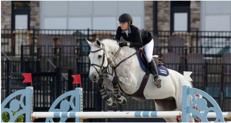
Harmon Classics Labor Day Spectacular, Tryon Equestrian Center

Meeting at the Whimsical World Gallery, 116 Jones St. Landrum, SC • Mailing Address: UUFCF, P.O.Box 653, Tryon, NC 28782