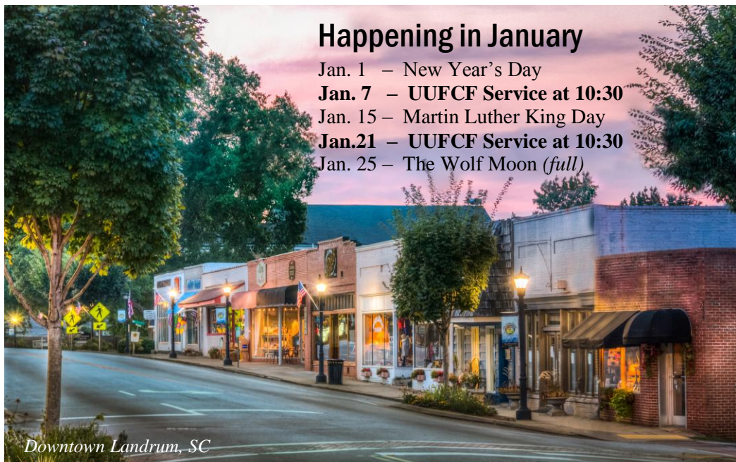
Downtown Landrum, SC