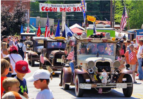
Coon Dog Day in Saluda

Meeting 1 st and 3 rd Sundays of each month at the Whimsical World Gallery, 116 Jones St in Landrum, SC Mailing Address: UUFCF, P. O. Box 653, Tryon, NC 28782