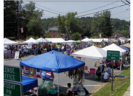
61 st Annual Columbus July 4 Festival Fireworks begin at 9:45